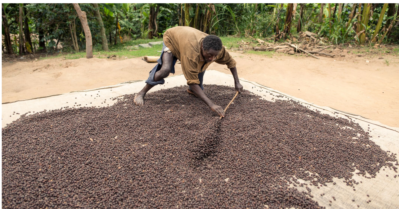
Spreading coffee beans to dry in Kilembe, Kasese district, Uganda.

The Ugandan team also learned that where there was strong buy-in, there was strong impact. For example, the Kenya and Rwanda studies had generated high-level buy-in, and this contributed to strong policy influence. In contrast, the Tanzania study did not garner high-level champions, which resulted in a lower impact. Learning from this, the Uganda study concentrated on generating high-level political buy-in and ownership of the study from the start.