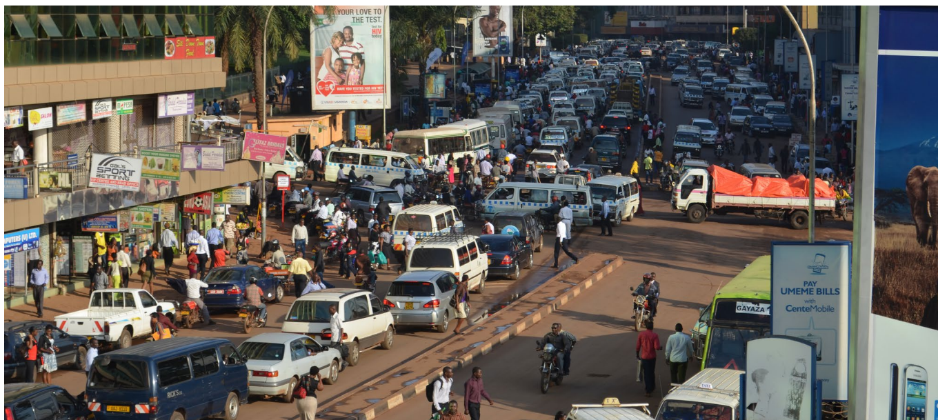
Road in Kampala.

By presenting the study results in a variety of national and international fora, and achieving high press coverage, the key findings of the study were easily conveyed and generated substantial debate that shaped the country's climate agenda.