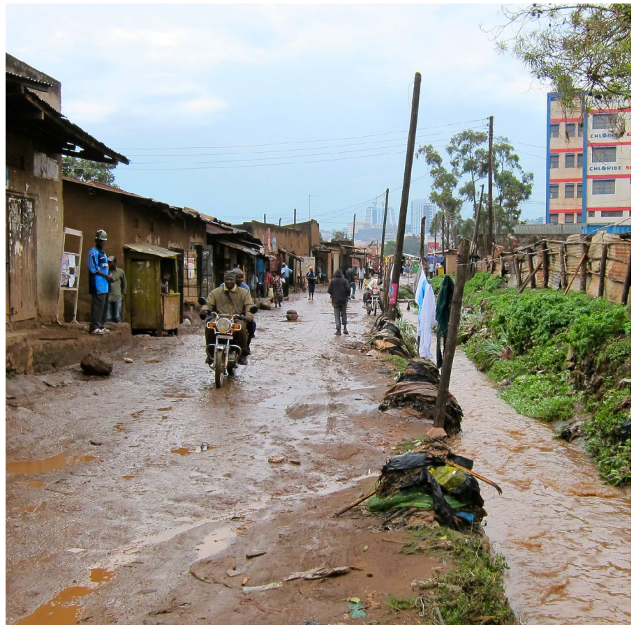
After the rain, Kisenyi, Kampala.

The study's main message was that the “cost of inaction” on climate change in Uganda was 20–24 times higher than the cost of action and/or adaptation, estimated at between US$ 273–427 billion. 11 It also provided costings for not pursuing adaptation across different sectors. For example, the study concluded that by 2050 the impacts of climate change could result in: a 40% reduction in the yield of staple crops (a loss equivalent to 16% of Gross Domestic Product), a 50–75% decline in coffee production and exports (reduced foreign exchange), significant energy supply deficits (biomass and hydro-electricity generation), and rising water supply deficits, with losses estimated at US$ 5.5 billion that could be as high as US$ 50.3 billion if income elasticity is taken into account. 12