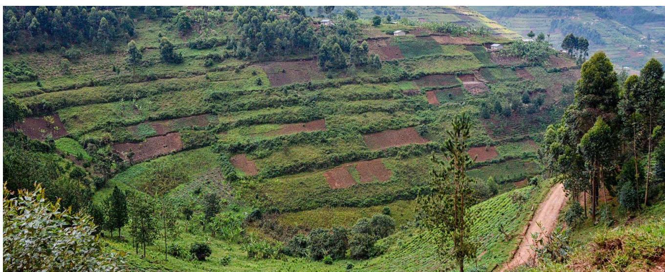
Small log farming, Uganda.

production through the Farmer Field School Approach. 27 Informed by the study results, the Climate Change Department submitted a National Adaptation Plan readiness proposal titled 'Strengthening adaptation planning in Uganda' to the Green Climate Fund, which was approved. The proposal refers to the cost of inaction from the economic assessment study as one of the justifications for the funding request.