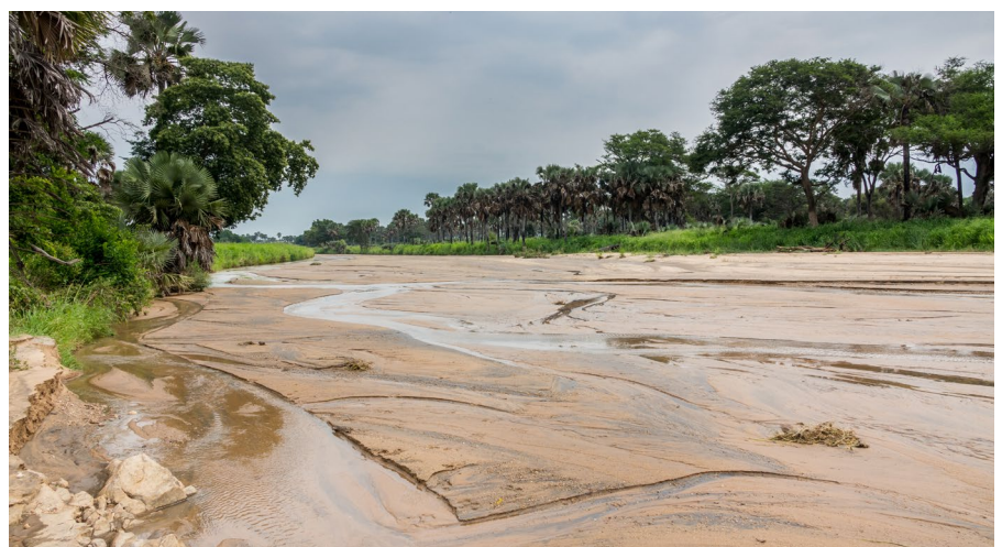
Kidepo River, seasonal river in Karamoja sub-region of Uganda.

While some sectors, like agriculture and water, were very supportive of the study team, engaging with others, such as the energy sector, was more challenging. The Energy Ministry had limited interest in climate change issues, given Uganda’s engagement in oil and gas development. The ministry was also receiving significant funding from development partners and the government budget, so there was less interest in a project that did not offer financial resources. As the main source of electricity in Uganda is hydropower, the ministry understood that the energy sector was already achieving low emissions. However, over time the ministry started to better appreciate how their sector was impacted by