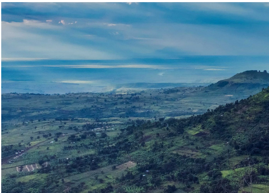
Mt. Elgon, Uganda.

Five case studies were pre-selected: (1) Kampala case study, tailored to the (urban) infrastructure sector assessment, (2) Mt. Elgon/Bududa case study, tailored to the agriculture sector assessment (focused on coffee as a cash crop) in a mountainous environment, (3) Karamoja case study, tailored to the agriculture sector assessment (focused on agro-pastoralism in a semi-arid region), (4) the Mpanga catchment case study, tailored to the water and energy sector assessment (watershed management and hydro-electricity generation), and (5) the health case study focusing on the impacts of climate change on malaria in Tororo and Kabale districts. The health case study was particularly unique because the health sector was not part of the national sector assessments but, together with the Karamoja case study, was included due to the suggestion of the Uganda country office of the UK’s former DfID.