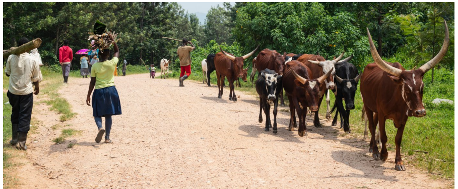
Herding livestock in Bugoye, Kasese District, Uganda.

Over two years (2011–12), CDKN held face-to-face engagements with the Minister and Permanent Secretary; the Chairperson of the National Planning Authority; and the Commissioner of