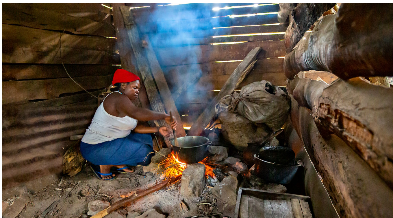
Cooking with firewood in Kibaale District, Uganda.