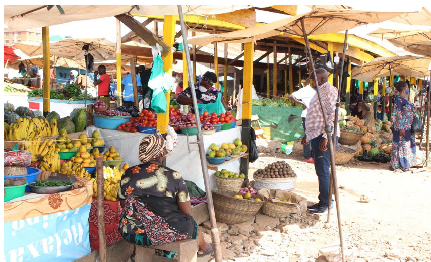
Kalerwe Market, in the suburb of Kampala city.

We document the process and strategies project actors and the Ministry of Water and Environment (as the study owner) employed, as well as the achievements and lessons learned. Online and face-to-face interviews were conducted (from July 2020 to May 2021) with those who participated in the study design and execution, including decision-makers who have used the products to inform policy and planning. Assessing the study process a few years after it was conducted has allowed interviewees to reflect on its impact.