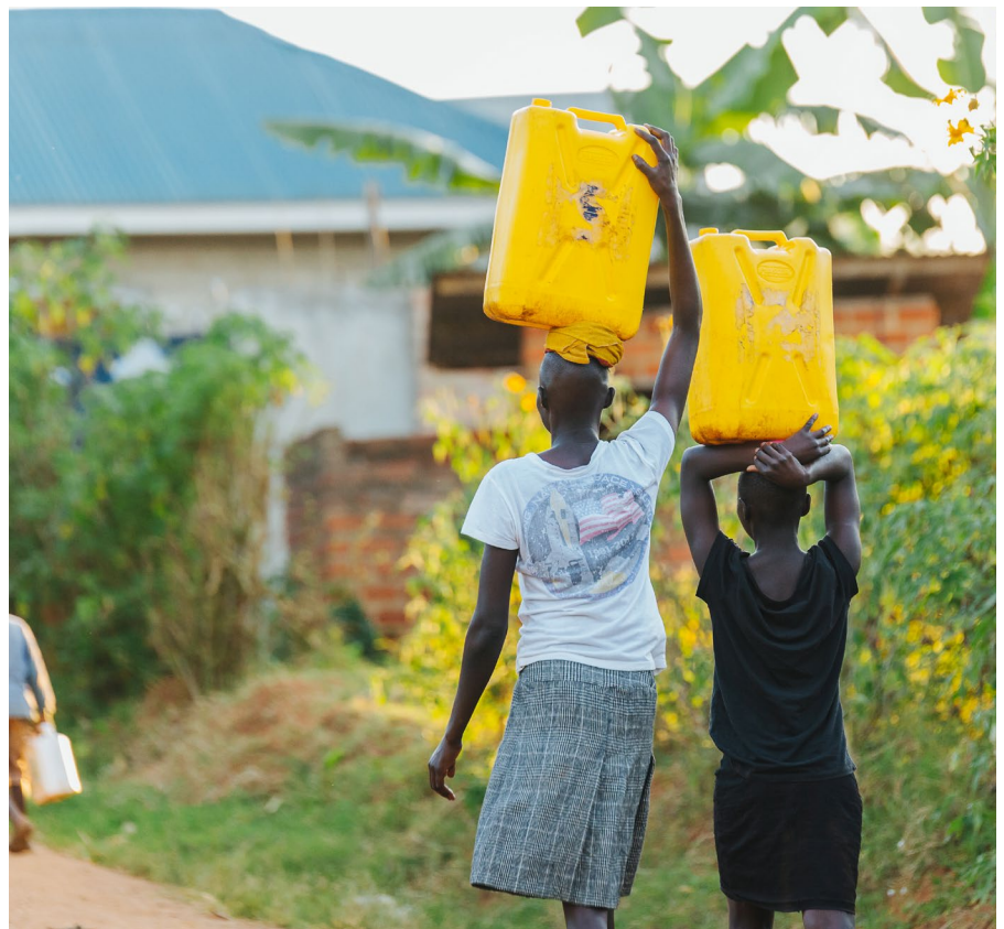
Women carrying water in Uganda.

Nevertheless, the outreach events that were used to disseminate the study knowledge products helped to raise awareness on the study and climate change more generally. These included a one-day high-level outreach event held in Kampala in November 2015, attended by over 130 high-level participants. A side event was also held in December 2015 at COP21 in Paris, France, to disseminate the key results of the study to the global climate change community.